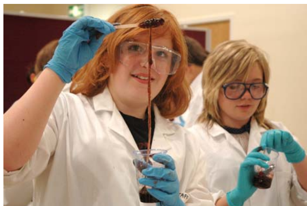
Students experience making 'goo' polymer chains. They also decorated gloves made from polyvinyl acrylate – the material used for Wonderland's dresses.

The day was a great success with students engaged, excited, animated, working collaboratively and sharing experiences. Learning was heightened because of the opportunity to try experiments themselves and play with materials.