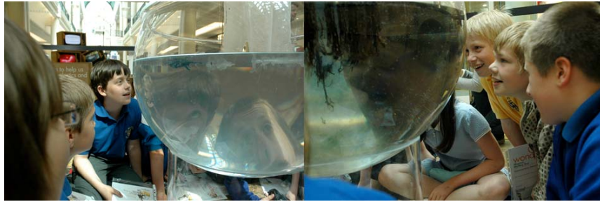
Groups gathered around each bowl and a great amount of discussion was generated.