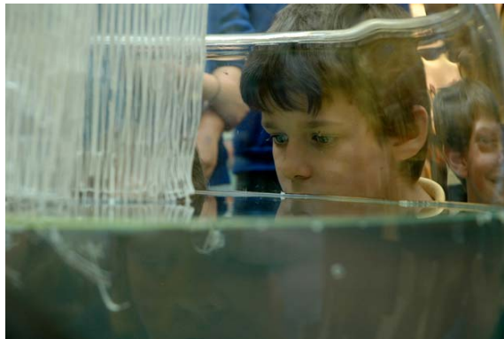
“It’s getting destroyed like monsters. The water’s ripping away at the dress -as if it had invisible piranhas in there.”